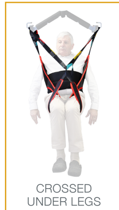
CROSSED UNDER LEGS